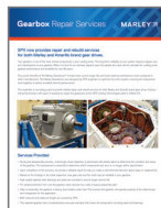
Marley Gearbox Repair Services

For additional information about the Marley Geareducer, request these publications at spxcooling.com