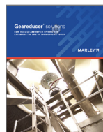
Marley Geareducer Solutions Brochure