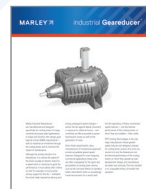
Marley Industrial Geareducer Data Sheet